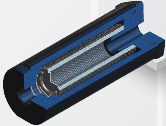
Flow -vs- Pressure Drop (FRH-308273)